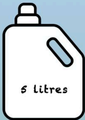
5 litres white vinegar