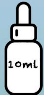
10ml Orange Essential oil