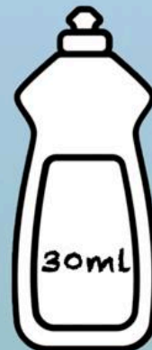
30ml dishwashing liquid